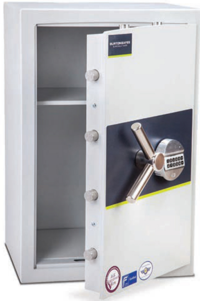
Eurovault Aver Grade 1, Size 3 with electronic lock