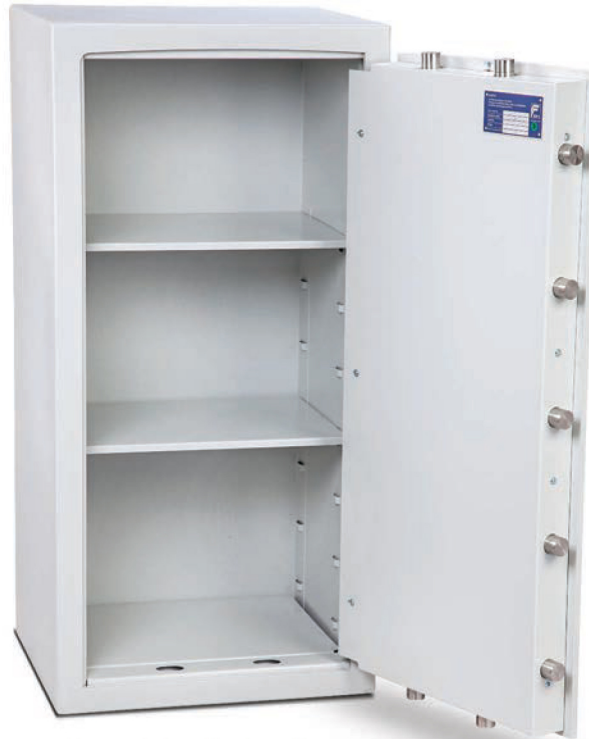
Eurovault Aver Grade 1, Size 4